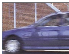
Interlaced, 20 ms difference between odd and even lines