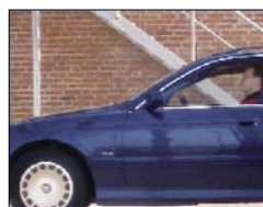
Progressive Scan, all lines are captured at the same time

Progressive scan is used instead of the interlaced method found in analog CCTV (PAL/NTSC) cameras. With progressive scan all pixels (lines) are captured at the same time, enabling moving images to be presented without distortion.